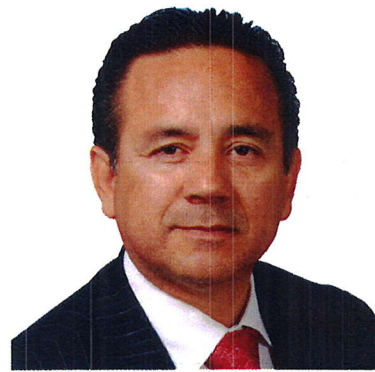
TEXAS STATE SENATOR CARLOS URESTI